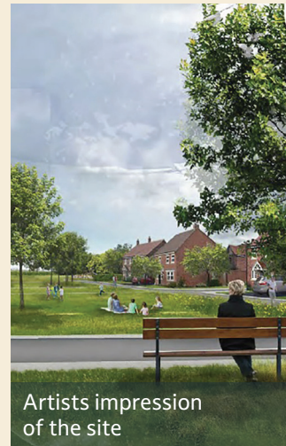
Artists impression of the site

We want to hear your thoughts on the proposals and how it can best benefit you as a resident of the community. We are holding an in-person drop in event on Wednesday 31 January to give you an opportunity to view the proposals, provide your feedback and meet the project team. Further details can be found below.