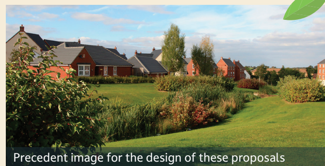
Precedent image for the design of these proposals