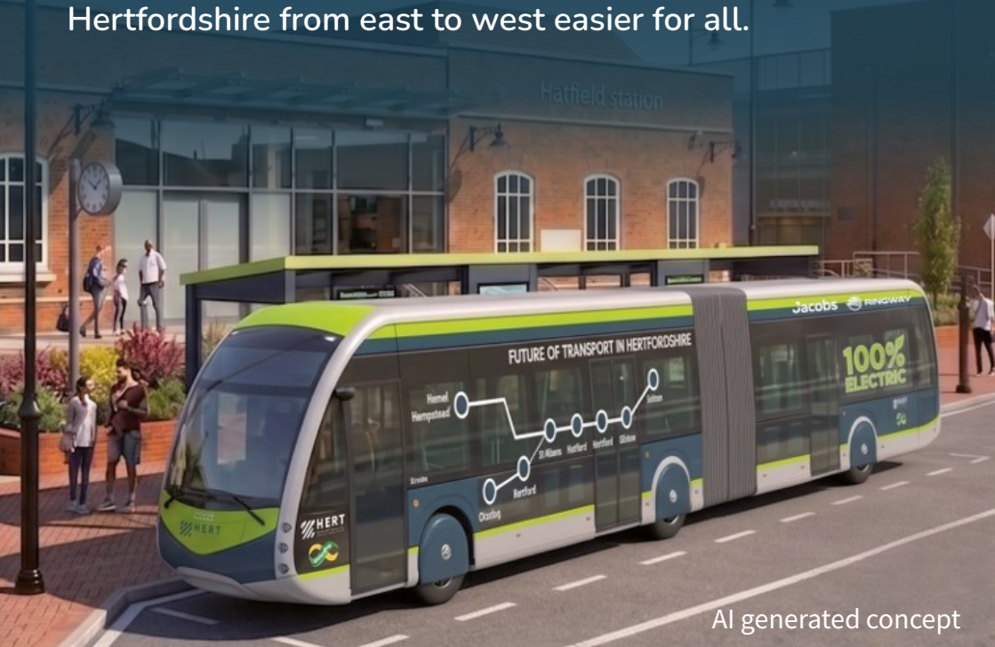
AI generated concept

A new form of transport that will make travelling across Hertfordshire from east to west easier for all.